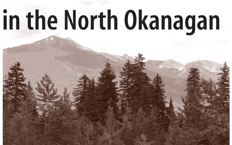
Mt. McKenzie, proposed ski area near Revelstoke

Indeed. Both OKIB and Westbank First Nation (see article this issue) to the south have made collaborative liaison with local governments a priority. Good, two-way