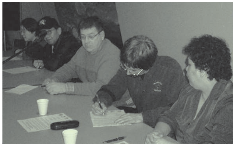
On December 19, 2006, the Village of Lytton and five First Nations (Siska, Skuppa, Lytton, Kanaka Bar and Nicomen) signed a Protocol Agreement on Cooperation and Communication as a first step to achieving sub-regional governance.

Sub-regional governance could help to create joint service areas to include the Village of Lytton and some or all of the five First Nation communities. The Premier suggested that Mayor